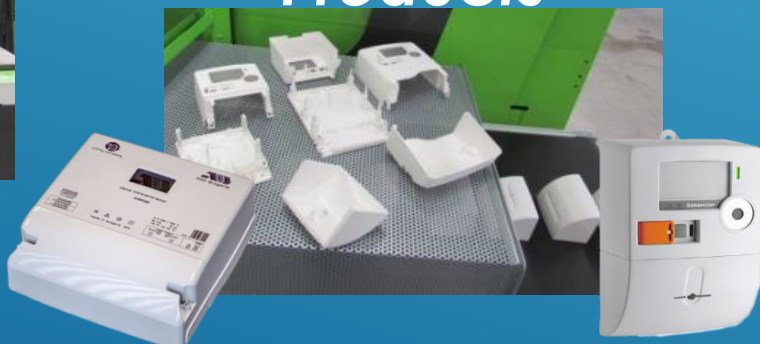
ARISTA Data Concentrator